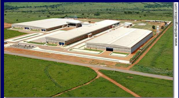
$180 million investment coming to Edinburg